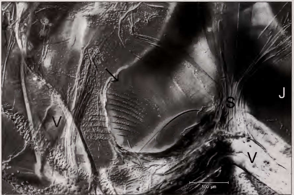
Fig. 1. Eurrhypis pollinalis ([Denis & Schiffermüller], 1775). Caudal view on the left side of central part of male genitalia showing two synapomorphies of Eurrhypini, the 'structurae squamiformes' (S) arising in the middle of the vinculum (V) and the 'ruffled membrane, laterally of this structure (indicated by the arrow); both characters are situated caudally to the juxta (J). (GU Nuss 933-00; extended focus-option: 61 planes with an interplanal distance of 2 \mu\text{m} , object depth 123 \mu\text{m} ).

Within Odontiinae, there are 367 species described worldwide (Heppner 1991) placed in more than 100 genera (Fletcher & Nye 1984; Nuss, unpubl.). Munroe (1961, 1972,